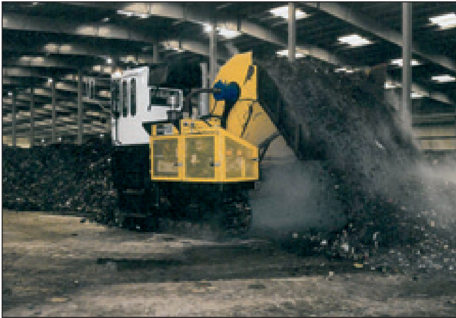
Sorting and Composting - Naameh

m 2 for expansion of the existing landfill, in order to ensure its continued use until the alternative landfill covered in the Household Solid Waste Management Plan (SWEMP) is ready.