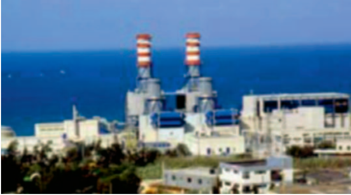
Power generation plant in Deir Amar