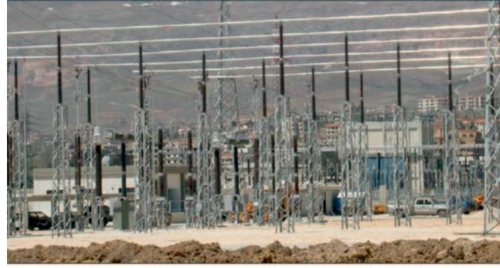
Eight countries interconnection network in Kssara Station