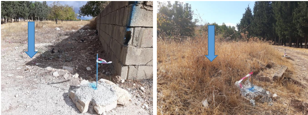
Figure 3: Site photographs of the proposed location of PS6

Appendix 6 presents an aerial image of the design and proposed location of PS6. Relocating PS6 would lead to decreasing the length of the sewer line by 30 m. It would not impact the number of housing units benefiting from this station, neither now nor in the future. It would require designation of an area of 560 m 2 at lot 639. Following an official request from LRA, the Engineer, BTM, shall prepare a designation file for the required additional area and submit it to CDR. After approval, the file would be transferred to the Ministry of Energy and Water and then to the Ministry of Finance for approval. The expected time to complete these procedures is three months but the procedure is administrative and doesn't affect the commencement of construction works.