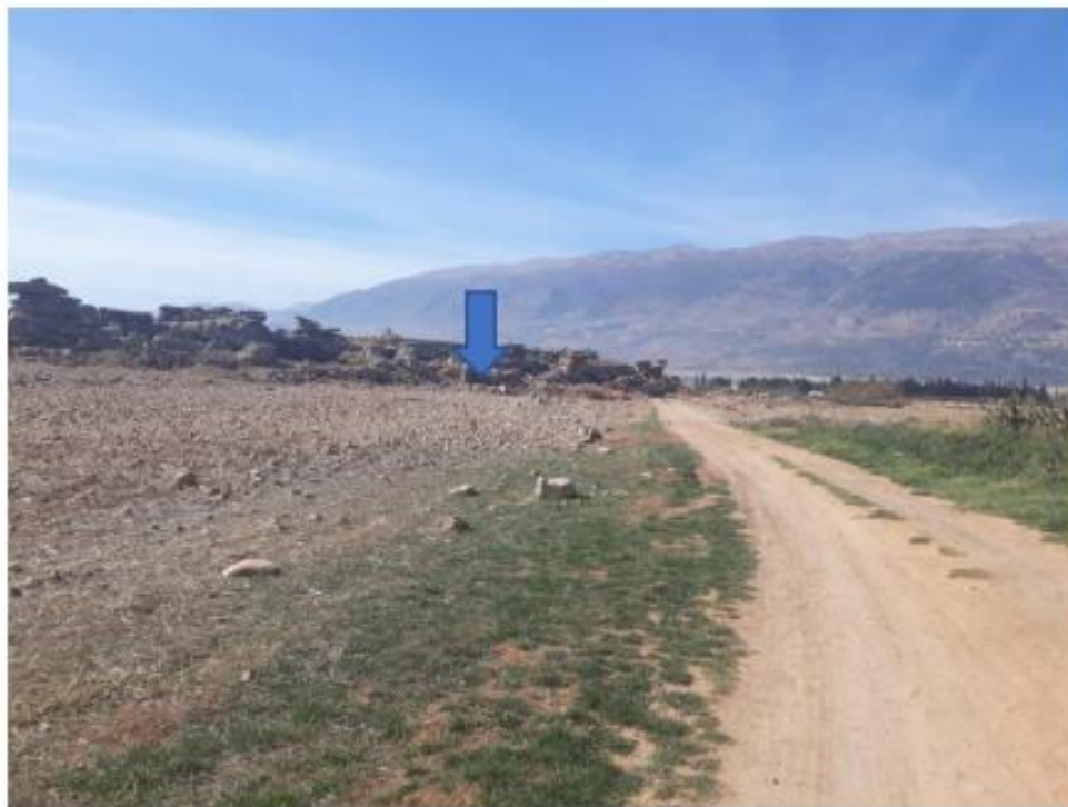
Figure 2: Site photograph of the proposed location of PS3

Appendix 5 presents an aerial image of the design and proposed location of PS3. Based on site photograph (Figure 2) and the aerial image of the proposed location of PS3, there are no